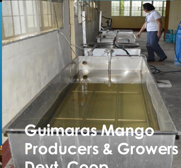
Guimaras Mango Producers & Growers Devt. Coop.